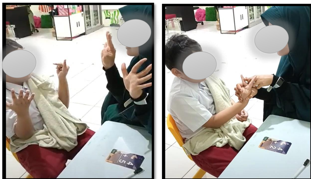
Figure 3. Addition using Flashcards

Figure 2 shows the interaction between the child with autism and the teacher in learning to count sums. The flashcards on the table are used to teach addition facts, and the teacher's role is to show the cards with numbers and ask the students to answer quickly. The teacher introduces terms such as "all," "together," "how many," "total," and "sum." These terms indicate that the student has to add two or more numbers. The fingers raised by the student indicate the numbers to be added, i.e..... The student holds up 4 fingers on one hand, and 5 fingers on the other hand and then counts while closing each of the fingers that have been held up until the count of nine, the sum is written on the flashcard, which is: