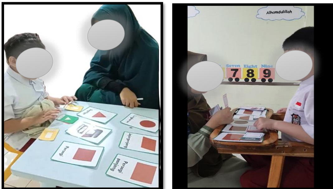
Figure 1. Geometric Shape Identification

Observations were made by recording learning activities, following the description of the observation results.