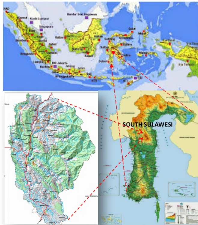
Figure 1. Research site

Application of ISM in this research is carried out through stages: first making a Structural Self Interaction Matrix (SSIM), where sub-elements are arranged so as to form a contextual relationship between variables i and j . Second, compile the reachability matrix (RM) by changing V, A, X and O with numbers 1 and 0, and third, composing a Matrix power-dependent driver to determine the arrangement of structural levels. Furthermore, a structural problem solving model was developed in the development of C. ensiformis cultivation.