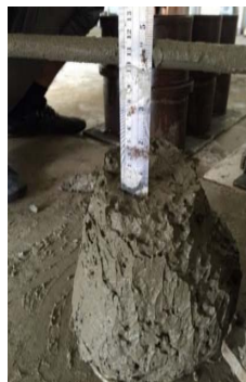
Figure 1. Slump Test.

Fresh concrete had a slump value of 9 cm with met the slump design of 10 \pm 2.5 cm. Visual observation (figure 1) revealed that fresh paste made with sea water and PCC could maintain the workability and homogeneity of the mixture without segregation, bleeding did not occur, and no coarse aggregates pilling at the bottom of specimen.