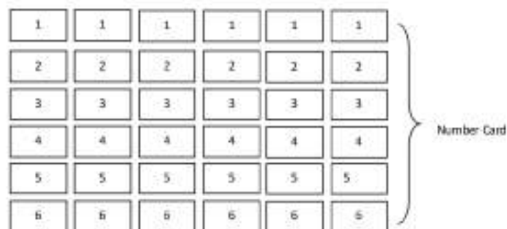
Figure 2. Dice and Number Card Tool

Implementing the role-playing model in mathematics learning is expected to help students achieve the objective of learning effectively by enabling students' cognitive elements, especially the mind element, to understand stimulation from outside through the processing of information so that it has an impact on learning outcomes. In this research, the effectiveness of the implementation of the role-playing model is measured by: (1) Mathematics learning achievement of students who achieve the minimum criteria, (b) Learning achievement that achieves classical completeness is 85%, and (2) Minimum student activities are in a good category.