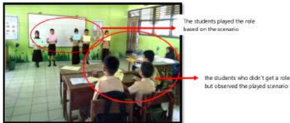
Figure 3. Student Role Playing Activities

Figure 3 shows that the students conducted the third activity, the students who didn't get a role but observed the played scenario, so the students could understand what was being acted and can finish the question given based on the played scenario. The percentage of students' activity during the implementation of the role-playing model in the learning process showed in the following diagram.